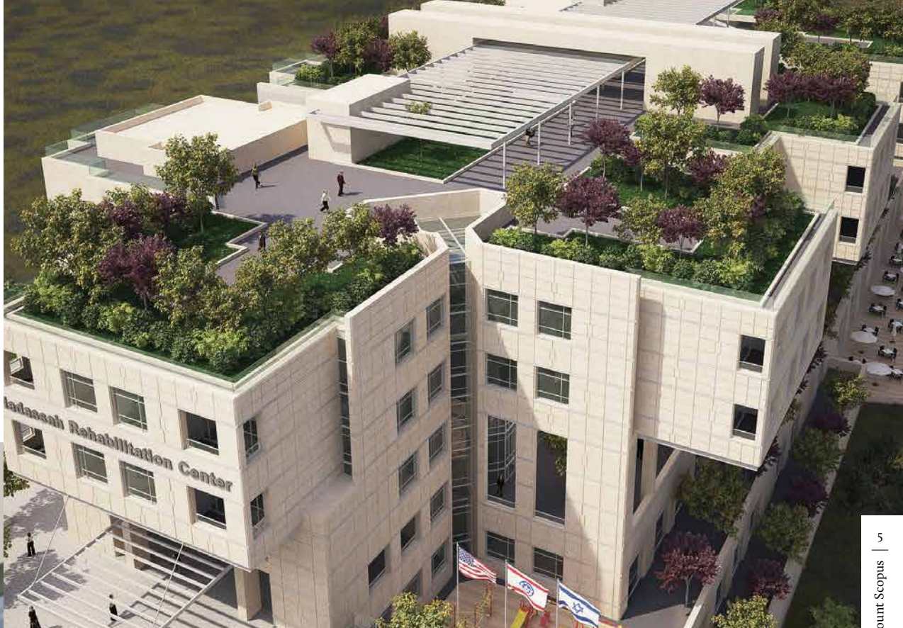
Jerusalem's new rehabilitation center at Mount Scopus (Architectural rendering)

T he Rehabilitation Center at Mount Scopus is the only facility serving over 1.2 million residents in the greater Jerusalem area. Built half a century ago, the Center has not been able to keep up with the city's population growth. The current center is outdated and exceeds capacity. Patients in need of immediate rehabilitation are confronted with a waiting time which can last as long as three months for treatment and risk longer and more complicated rehabilitation due to the lapse of time.