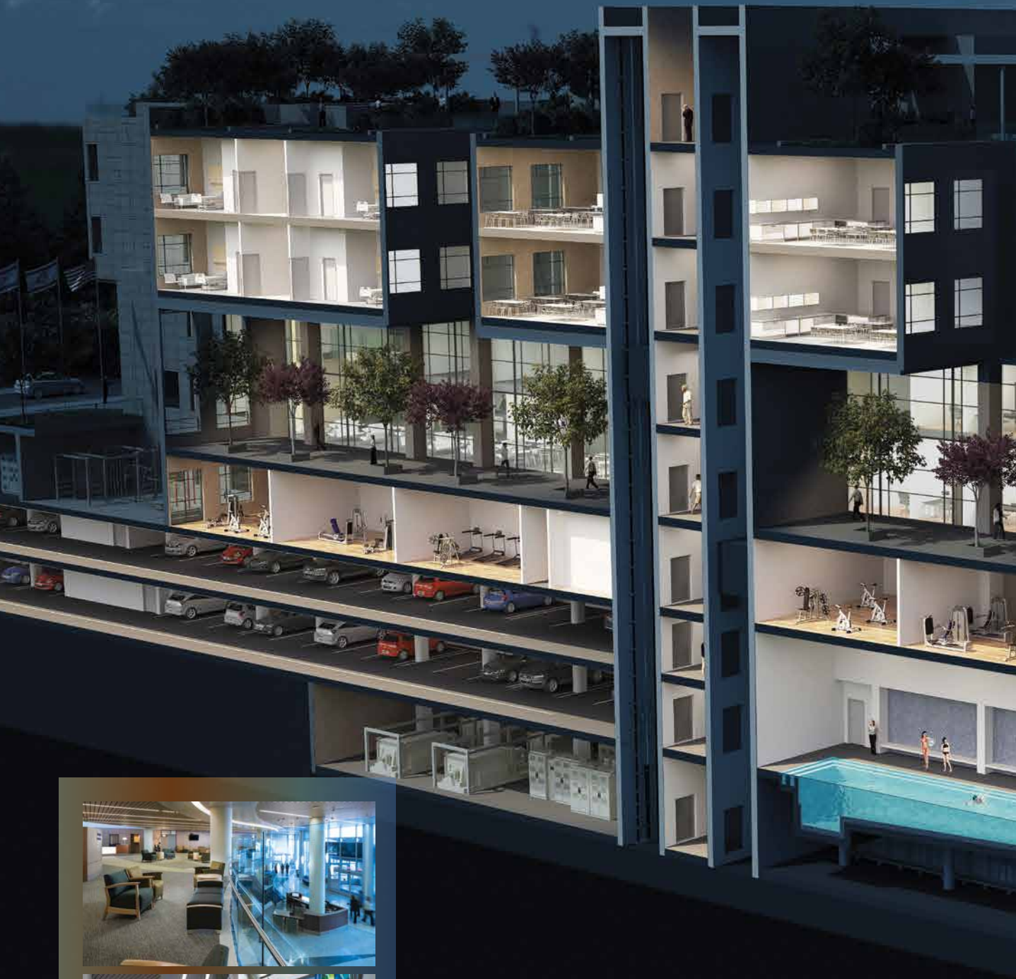
Jerusalem's new rehabilitation center at Mount Scopus (Architectural rendering)