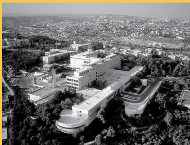
The iconic Mount Scopus campus

Hadassah Medical Organization, founded by Hadassah, the Women's Zionist Organization of America, Inc. established modern healthcare in Israel.