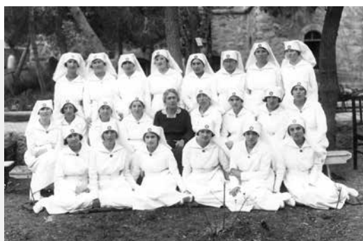
Henrietta Szold with first class of nurses at Hadassah Mount Scopus

LEARN HOW YOU CAN BRING HOPE AND HEALING TO JERUSALEM BY SUPPORTING ISRAEL'S SEMINAL MEDICAL CENTER.